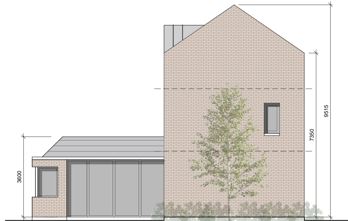
GABLE ELEVATION HOUSE No.63