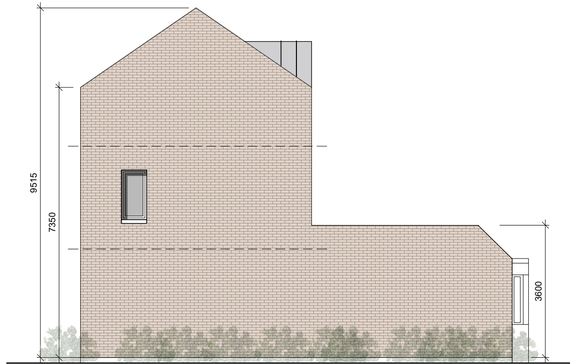
GABLE ELEVATION HOUSE No.62